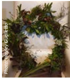
A wreath of local natives made by AvON & friends