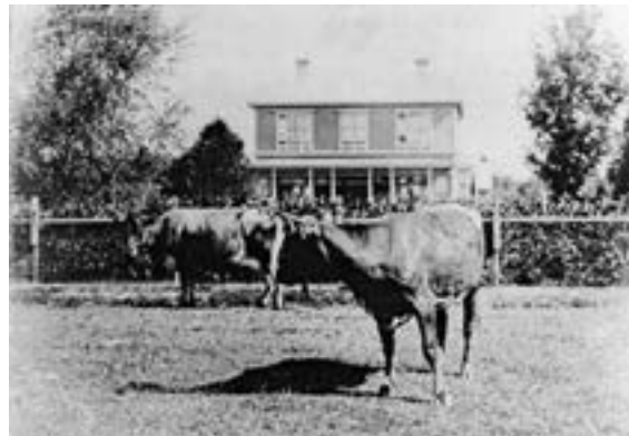
Avebury House c1900, before its makeover in 1907. The area outside the well-fenced garden was farmland. The cows are a nice touch!

Other parts of the Avebury estate had been purchased previously by the Government for housing. In 1951 the Government transferred ownership of Avebury to the Christchurch City Council. For a time, the Plunket Society made use of the house. Over the next few years, the grounds were developed as a public park, formally