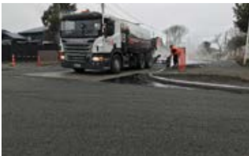
Warden St road works.