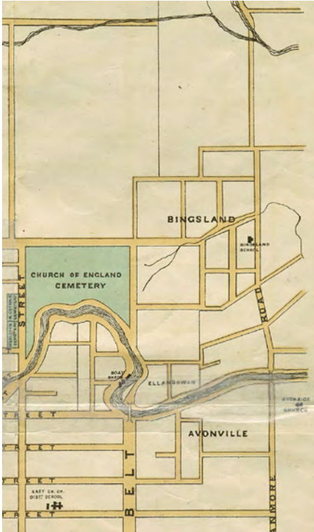
1879 map of Bingsland (Part of) Plan of Christchurch and suburbs, 1879