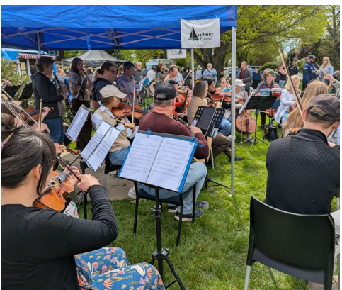
"The feel of the whole day was just so beautiful. Lovely to see families and their pets out. The Devonshire teas were amazing. I have never felt so welcome back into the area where I used to live. Keep up the good work and I'll be there next year."