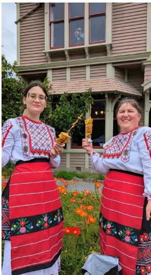
"A very successful afternoon with great community spirit."